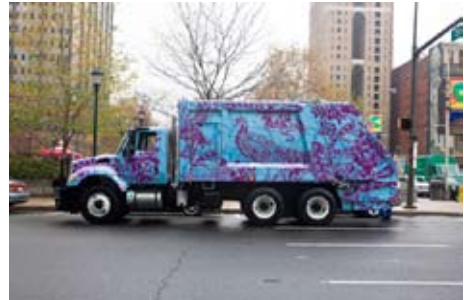
Painted sanitation truck from Philadelphia